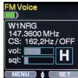
Figure 2 — The PicoAPRS in FM voice mode.

For those already knowledgeable about APRS, I should mention that the relay path is fixed in the PicoAPRS at WIDE1-1, WIDE2-2, except when you select the International Space Station packet digipeater frequency of 145.8250 MHz. At that frequency, the path defaults to ARISS, WIDE2-1.