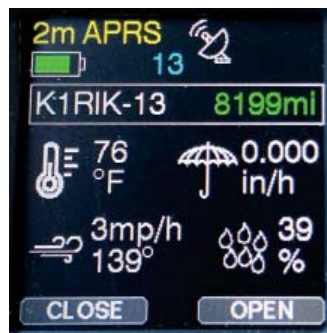
Figure 3 — Receiving weather station data via the local APRS network.

The PicoAPRS can operate while being powered through the USB-C cable. That being the case, you could use the radio as the core of a permanent home APRS station.